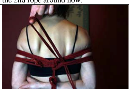
9) Reverse direction and come under the lower wrap from the bottom, emerging at the top

8) Add the second lower wrap and come under the stem