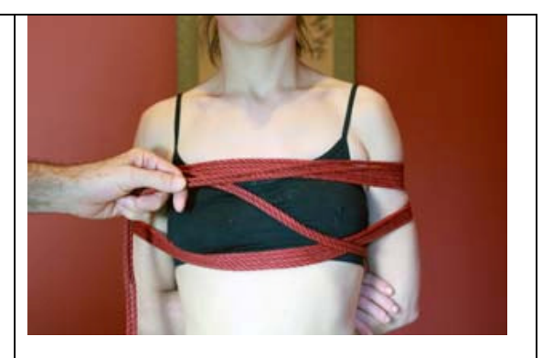
16) Return to the front