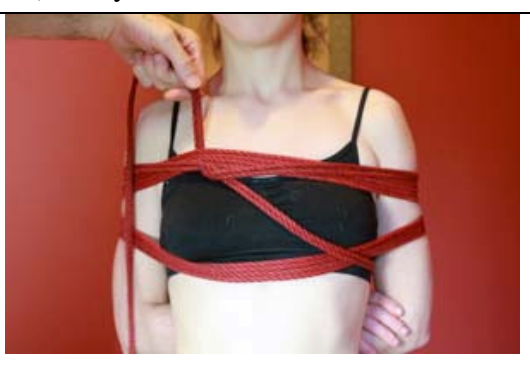
17) Catch the diagonal and come under the upper wrap.