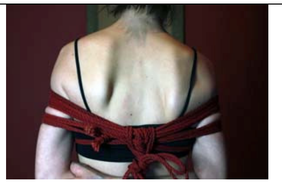
30) Tie off and use up any surplus with macramé