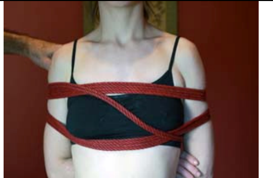
12) Continue under the lower wrap to the front

13) Continue either under or over the breast