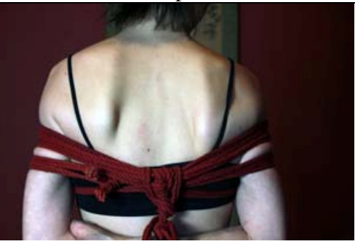
29) Make a friction around the stem